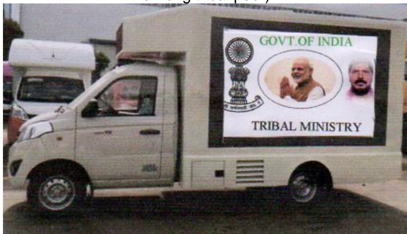
Audio Visual Unit Van with led screen interactive panel display for Awareness education

(for Awareness towards Education, Genetic Diseases, Economic Empowerment etc., among tribal poor)